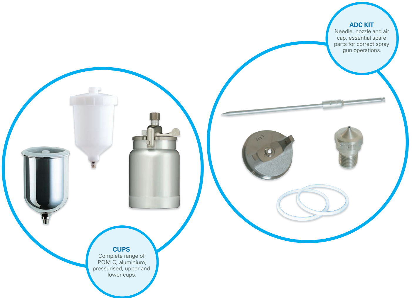
CUPS Complete range of POM C, aluminium, pressurised, upper and lower cups.

Main Asturomec® original spare parts supplied in practical packaging to maintain parts most subject to wear. Complete range of suction and gravity cups, available in the materials and sizes best suited for every type of use.